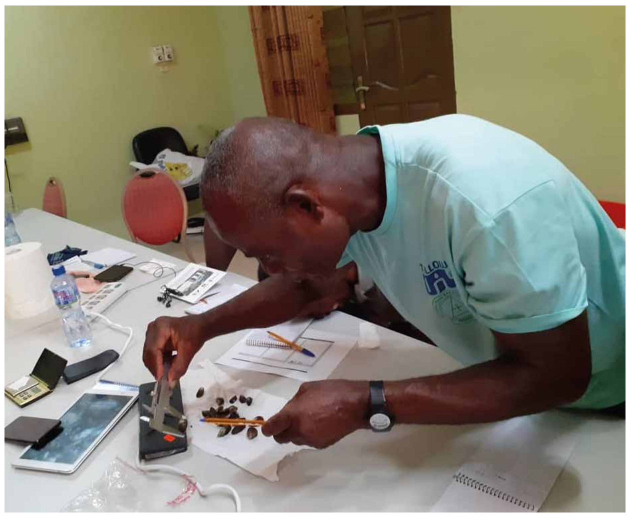
A cCitizen scientist examining sample mussels in a laboratory.

The unparalleled enthusiasm for this initiative was due to a carefully planned model that considered the citizen scientists interests and capabilities and that made their work pertinent to the oil producing communities where