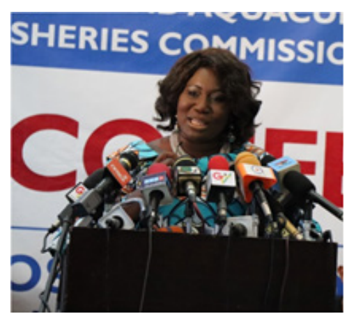
Naa Afoley Quaye, Minister of Fisheries and Aquaculture Development

"We cannot sit and watch the collapse of the industry.We care about the future of the fishing industry and we really need to push hard for the alternative that is finally better for the sector and the people."