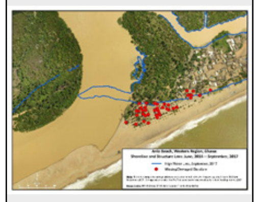
An aerial view of Anlo Beach with analysis that shows the impact of erosion.

SFMP trains local researchers to use unmanned aerial vehicles for identifying and mapping coastal communities in the path of floods and erosion.