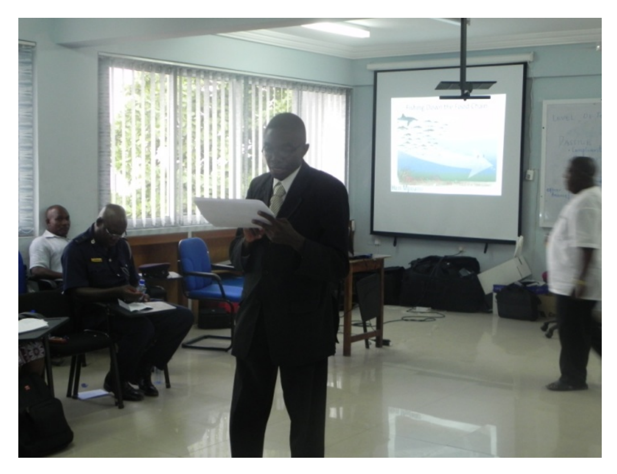
Figure 5 : A State Attorney presenting the state of Fisheries Cases during the 2nd Review meeting

The Fisheries Commission noted some by challenges to include the constant changing of police officers handling fisheries cases. Additionally, ineffective communication between the Fisheries Commission and the Navy was noted as affecting the prosecution of cases. Some points of note include: