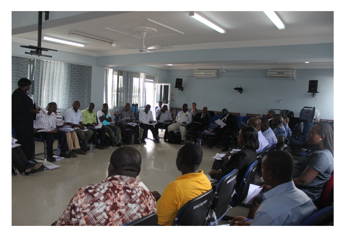
Figure 4 Experience sharing on prosecution cases by actors