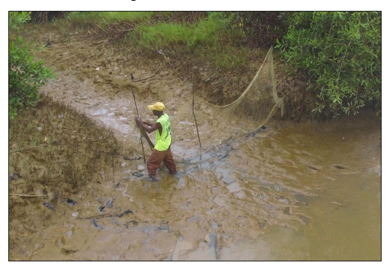
Figure 5: A fisherman at Anlo Beach erecting a set net during low tide

During high tide, many fish overflow with the water to the other side of the net from the main river. When the water recedes during low tide, the Tilapia and other fish species are left trapped in the mud, and fishers collect them with scoop nets.