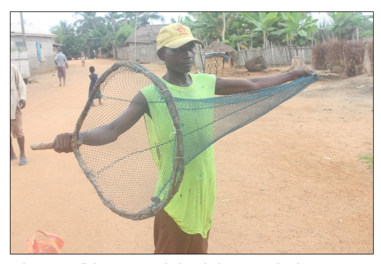
Figure 6: A fisherman at Anlo beach demonstrating how a scoop net is used