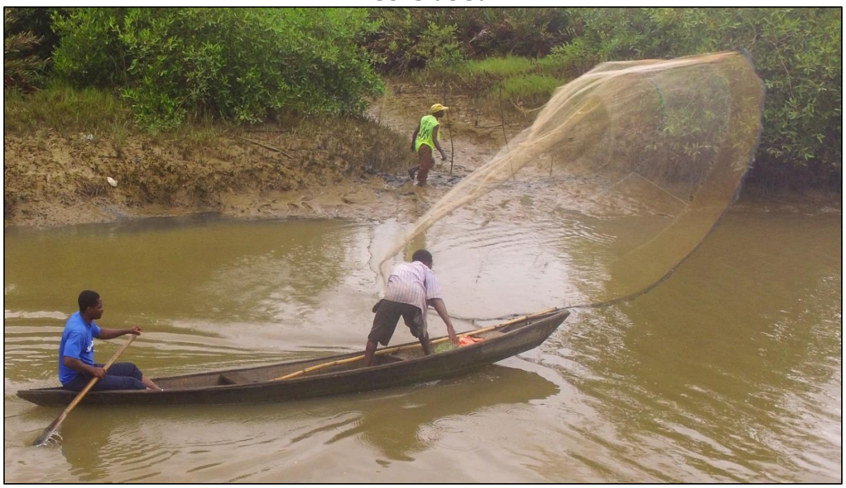
Figure 7: Fishermen throwing a cast net to capture fish in the Pra River