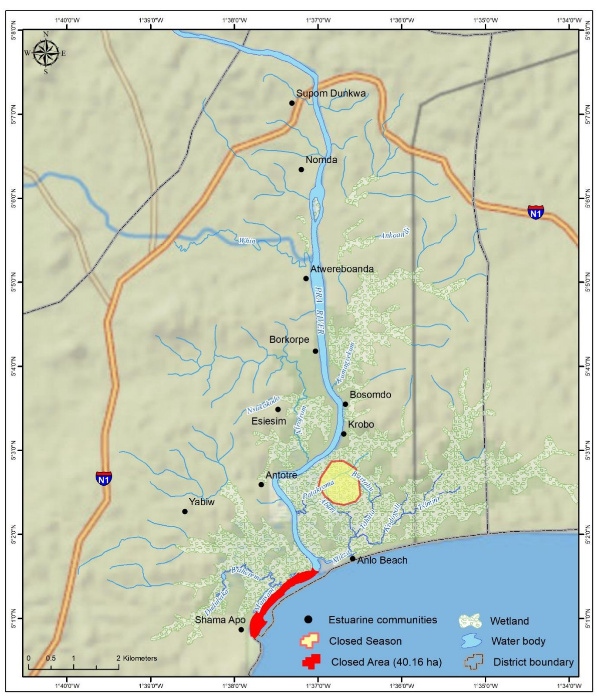
Figure 11: A map showing permanently closed area and an area to be closed seasonally