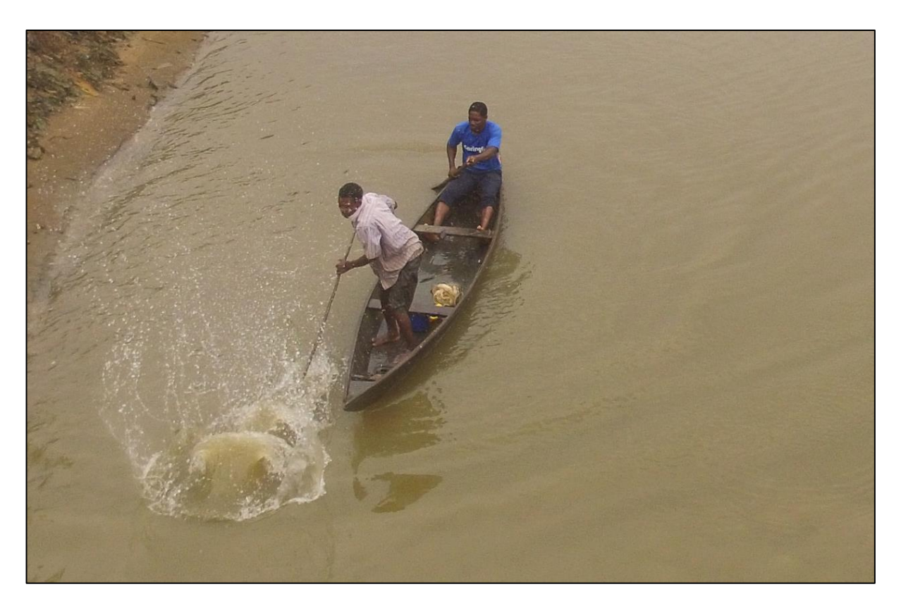
Figure 8: A fisherman agitating the water with a stick to drive tilapia towards a set net