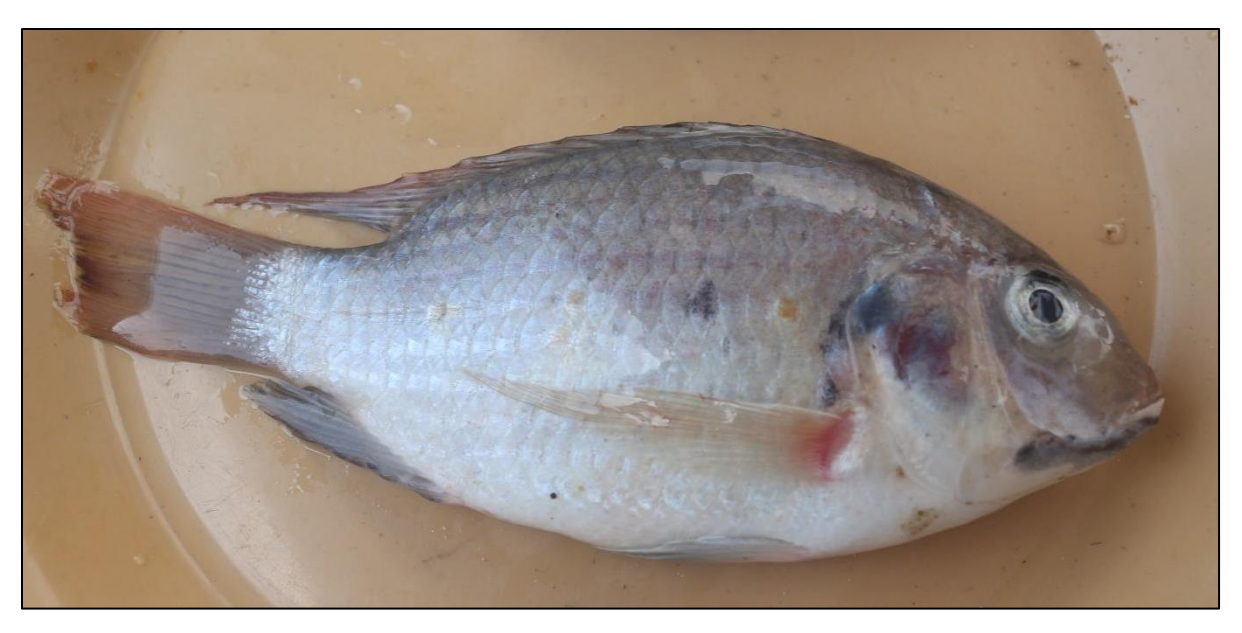
Figure 3: Sarotherodon melanotheron caught in the Pra Estuary. It is found to be the most abundant fish species