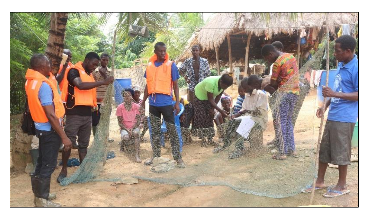
Figure 4: Set net being displayed by a fisherman to comanagement committee members