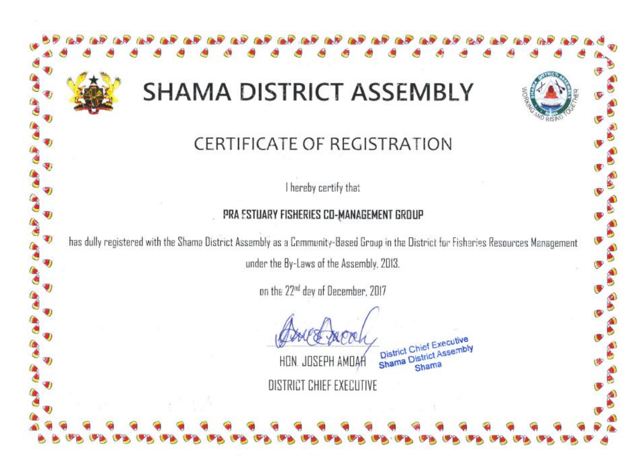
Figure 12: Certificate of Registration, Shama District Assembly