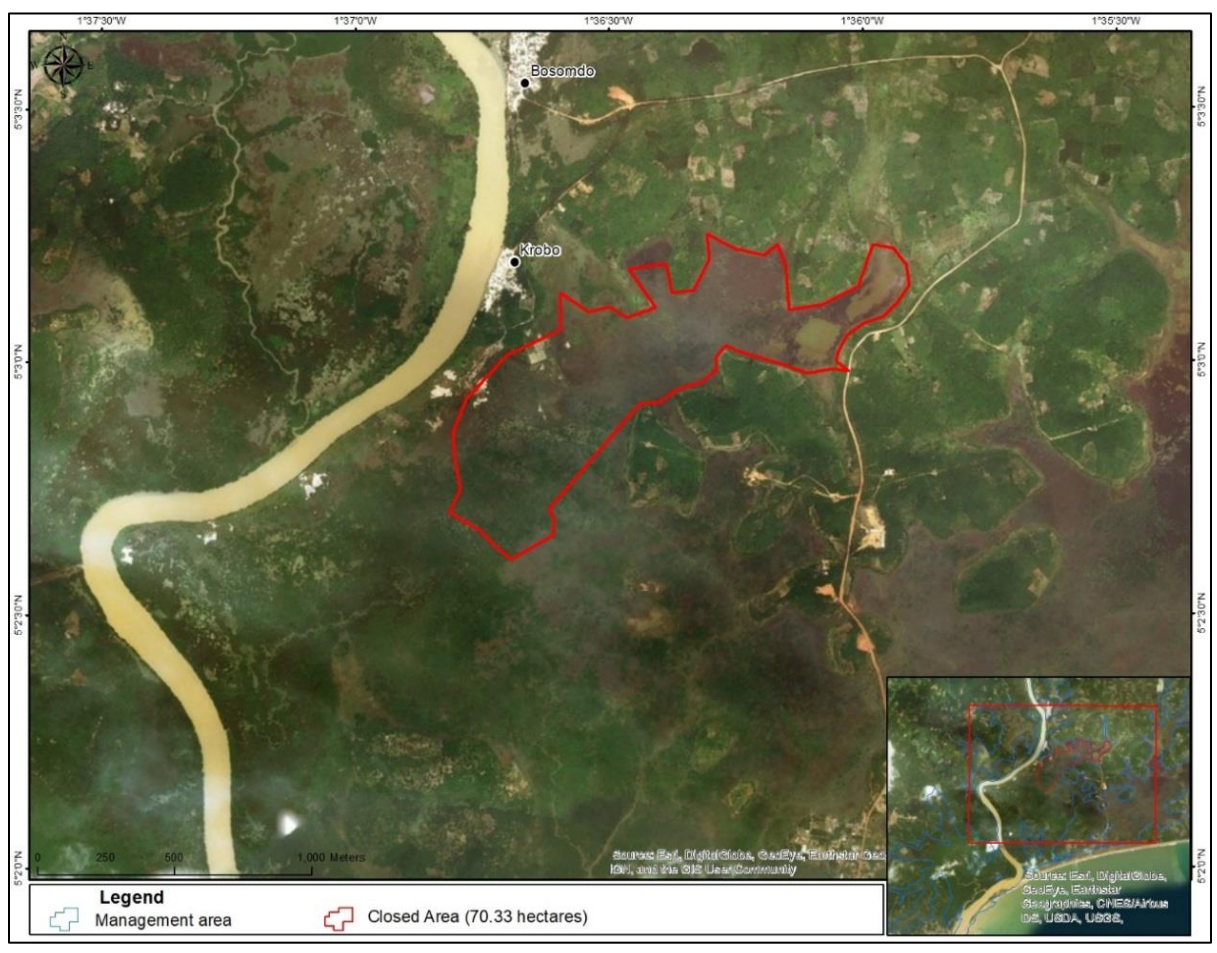
Figure 10: A map showing the area that has been marked for closed season implementation