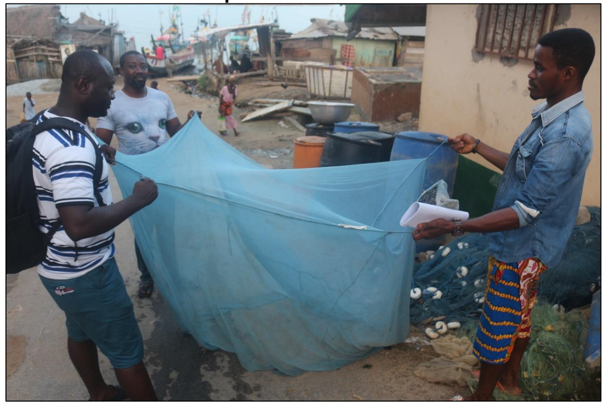
Figure 9: Mosquito nets used for harvesting juvenile fish identified and displayed by FoN and Fisheries Commission officials during Participatory Rural Appraisal exercises