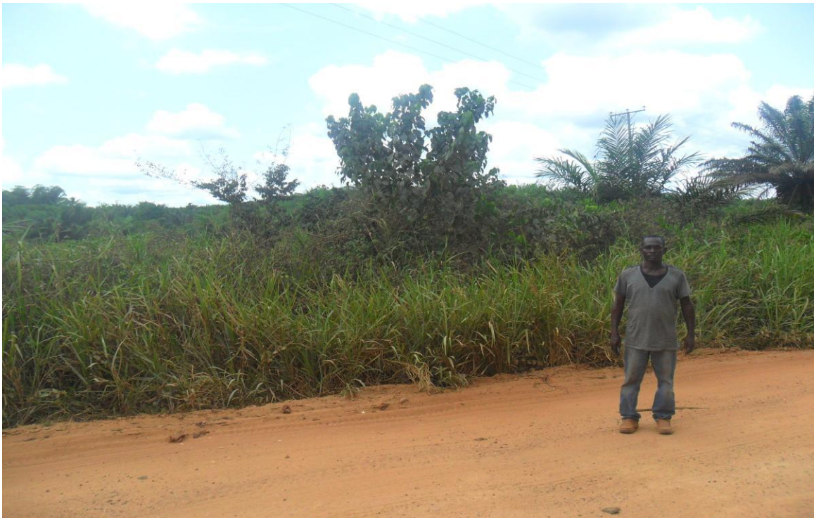
Regional Chairman of GNAG at the relocation site