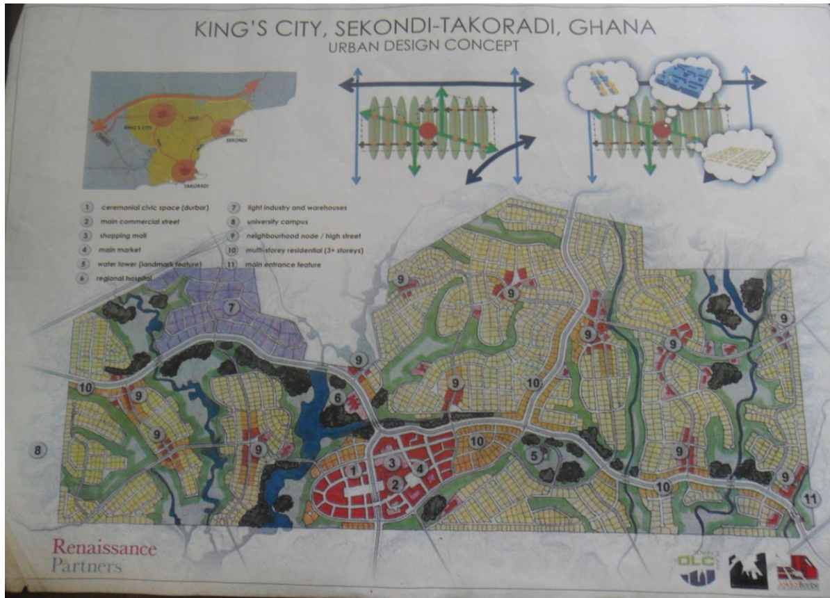
Proposed Kings City for STMA

These proposed cities and spatial development plans are basically aimed at effective land use for current and future purposes to promote development and general well-being of the citizenry.