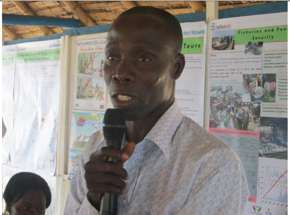
Figure 6 District Chief Executive of Ellembelle making a contribution