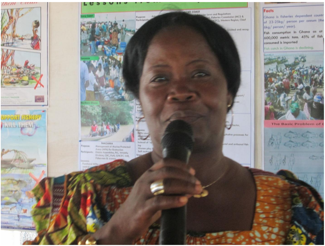
Figure 3 Gender Desk Officer of Jomoro District Assembly making a comment