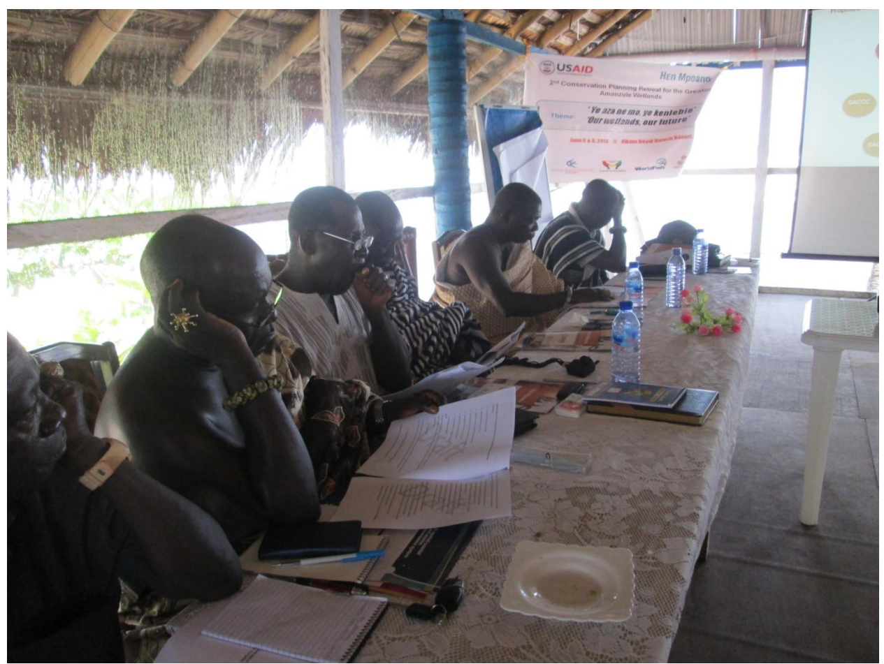
Figure 4 A section of traditional Chiefs at the Retreat