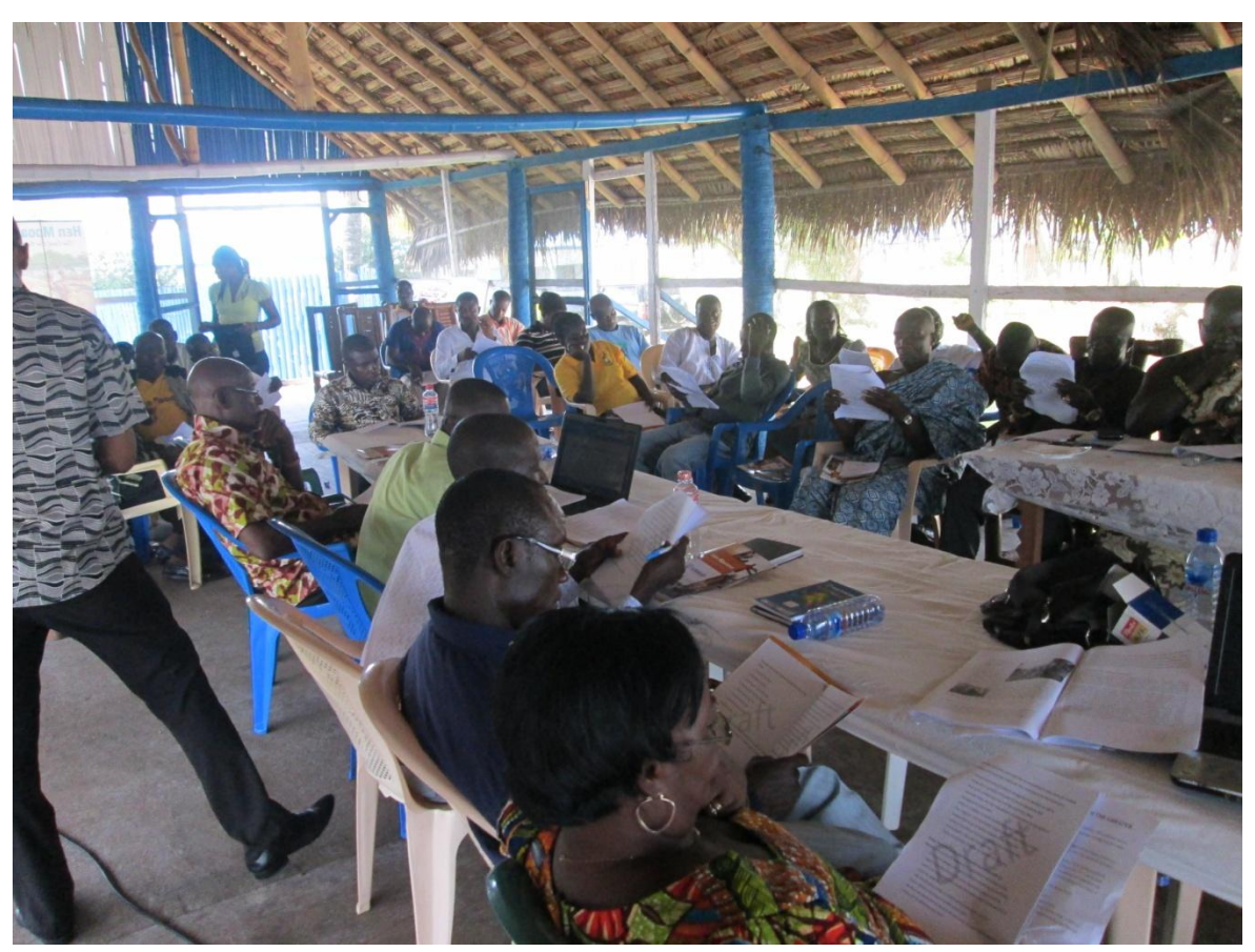
Figure 1 Cross section of participants

close out in September 2013. He was appreciative of the constituencies established and the commitment from stakeholders since the inception of the project. Mr. Agbogah highlighted the core activities and impact of the Initiative's actions in the six coastal districts and more details on the districts forming the Greater Amanzule Focal Area. He touched on the impacts of several studies / assessment carried in the area, lessons from study tours, Population Health and Environment Interventions among others.