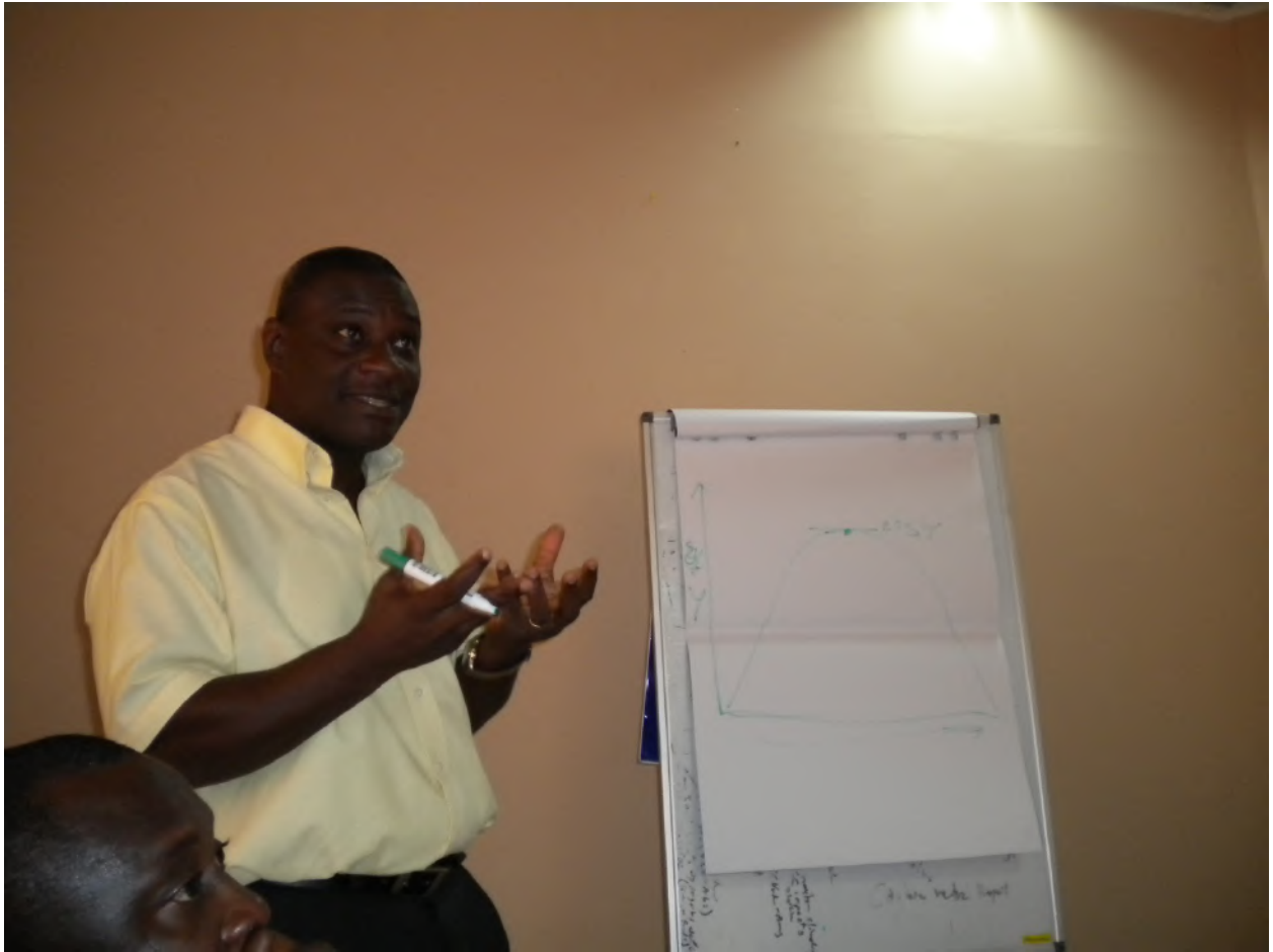
Figure 3 Director of the Hen Mpoano Initiative educating the Fisheries Working Group