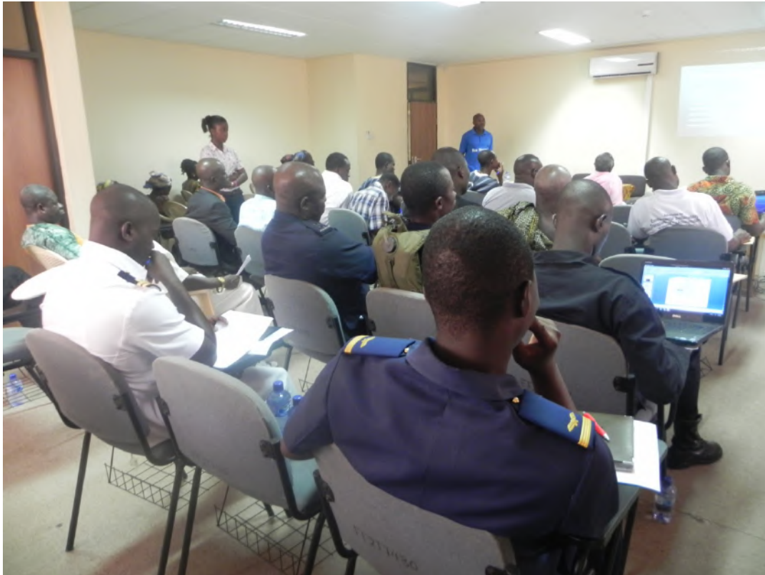
Figure 5 A cross-section of participants during the round-table meeting on voluntary compliance

A round-table meeting on voluntary compliance was then organized by the FWG on May 28, 2013 on the theme “ Addressing Challenges of Compliance and Enforcement of the Fisheries Regulation ”. At the end of the meeting, a communiqué 3 was issued by the 47 stakeholders who attended the meeting. Prior to this round-table meeting, the MuGPS had already visited the coastal communities with some members of the FWG to sensitize them on their mandates. To strengthen regional and district level governance, a courtesy call was paid to the Regional minister’s office to introduce the MuGPS and the FWG