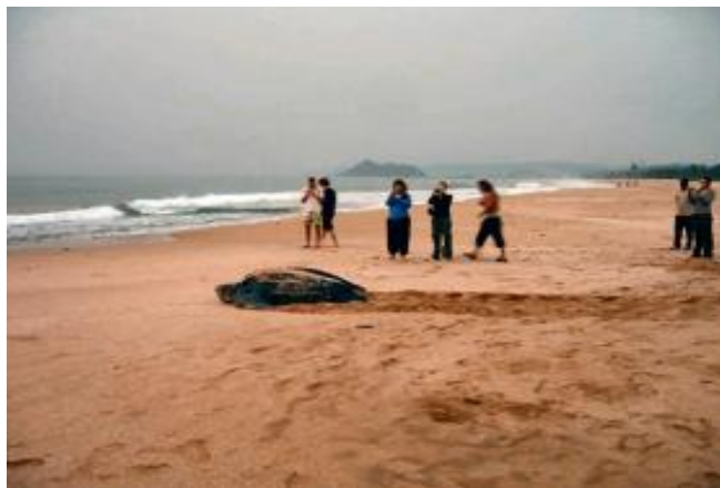
Figure 14: Tourists observing turtle at a conservation site

A program to protect sea turtle hatchlings started five years ago with one hotel in the Western region. This program has now evolved to include eight hotel owners and their neighboring communities. CRC will support the expansion of this work as a good example of public-private sector collaboration. This work has provided important research data on the four species of sea turtles that nest in the Western Region and allows for estimates of the number of nesting turtles per annum (over 400) in a stretch of beach from Butre to Half Assini (150 km). In addition, the program has worked with communities to save hundreds of turtles that would have been killed and eaten and has overseen the successful hatching and sea-entry of over 10,000 turtles. The data collected by the hotels, however, remains to be compiled and analyzed. Toward this end, CRC is identifying a graduate student it will fund to conduct research that will include collecting the data and publishing the overall results.