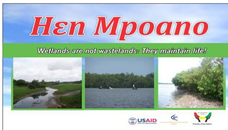
Figure 9: An example of a billboard communicating the importance of wetlands

A communications strategy document has been prepared in order to develop creative educational and communications actions that can effectively socialize the Initiative and its' objectives to diverse stakeholders as well as facilitating their adoption of the desired knowledge, attitudes and practices required for a sustainable exploitation of natural resources.