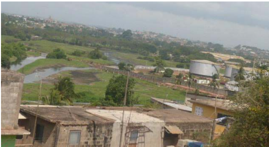
Figure 10: Aerial view of developments in a wetland area