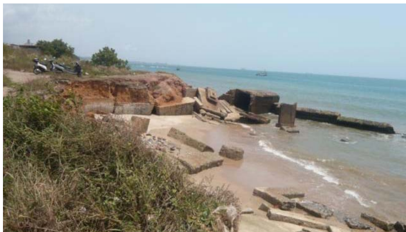
Figure 15: Coastal Erosion on some beaches in the Western Region