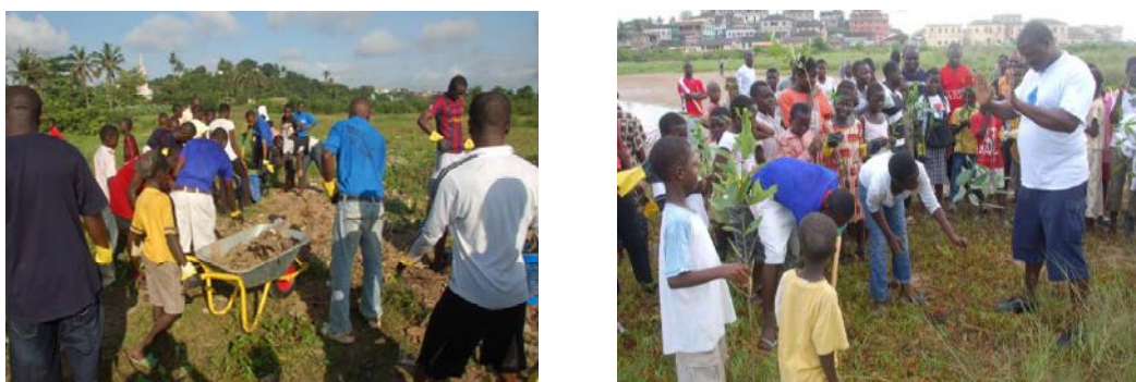
Figure 6: School children and teachers cleaning dirt from wetlands and replanting degraded mangrove areas as part of the small grant project.

One of the Initiative's early actions was to establish a Small Grants program aimed at supporting non-governmental and other civil society organizations to implement projects consistent with the objectives of the Hen Mpoano Initiative. As the result of an invitation to civil society groups in the Western Region, the Initiative received 43 concept notes. Twenty three were short listed. Of these, 15 were selected to receive small grants totaling 94,430.10 Ghana Cedis (US$ 64,124) to implement various projects that are slated for completion by December 2010. The small grants projects cover wetland conservation, alternative livelihoods, sanitation, environmental education and eco-tourism. Table 4 lists the grantees, their projects, and the districts where the activities are taking place. Meanwhile, CRC has developed a procedures and criteria manual for future grant making.