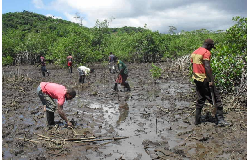
Figure 8: Mangrove replanting in the degraded Butre Wetlands in the Ahanta West District: An activity of the Conservation Foundation, supported by CRC Small Grants