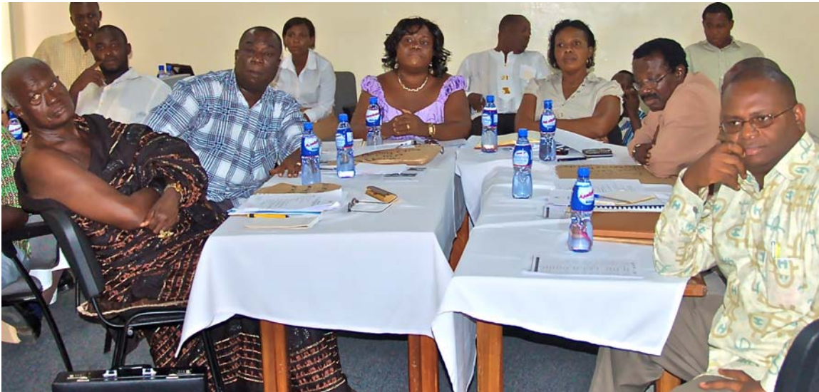
Figure 2: Advisory Council members at the inaugural meeting

The Council's role is to guide the development and pilot regional scale implementation of integrated policies, plans and governance scenarios for the fisheries and coastal areas of the Western Region. The Advisory Council was inaugurated in April and has met twice to review progress and provide orientation for the Initiative.