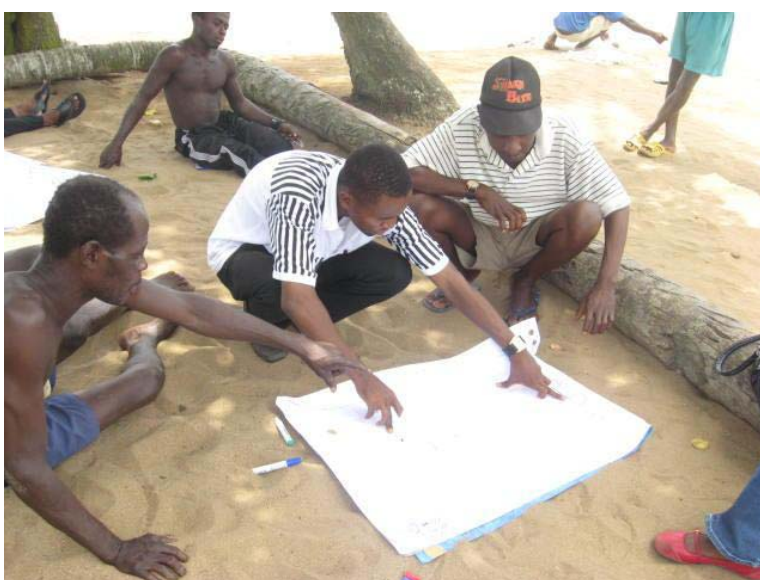
Figure 4: Mapping exercise with fishermen

Reports summarizing baseline information on each district have been completed. Emerging trends indicate severe shoreline and coastal habitat erosion in the communities, the weakening of the roles of Chief fisherman, conflicting perceptions regarding declining fish catches, use of inappropriate fishing methods, pressures on coastal wetlands for housing and other developments, harvesting and consumption of marine turtles, and other issues.