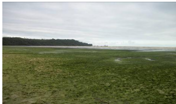
Figure 12: Fouled Beach with Algae Blooms

This situation calls for the urgent attention of the government of Ghana and its appropriate agencies as the algae drifts eastward from across the border. It is a disaster for the two coastal districts as fishermen are losing economic ground and are already faced with food security problems. Most of the tourist facilities (hotels or lodges) dotted along the coast have remained empty as the very beaches and the sea that attract tourists to these areas are fouled with the algae. CRC has been instrumental in raising the alarm with the Regional Government and the appropriate Ministry officials, notably within the EPA, MOFA, and Foreign Affairs (the latter through the Western Region government). CRC has also catalyzed the GCLME program into action by making contacts with Ivorian authorities and researchers and through planning of a study trip (December 2010) to Ivory Coast to assess the situation and propose possible solutions.