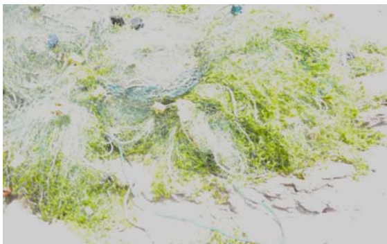
Figure 11: Fouled Nets

A commonly known algae, Enteromorpha , has been known to have annual blooms in the coastal waters of the Western Region for the past 40 years. Due to the filamentous nature of this algae, it prohibits artisanal fishing with nets in the immediate inshore areas. In past years, the blooms have not lasted more than one month. However, this year the bloom continued and lasted through the end of September with no sign of abating as of date of this report. The bloom impacts the entire coastal stretch from the two most western districts of the Region—Jomoro and Ellembelle up as far as the Ankobra River Estuary. This algae has been sufficiently studied by Ghanaian researchers, but only so far as the Ivory Coast border region. Hence, the true origins and cause of the algae bloom are not yet known. In addition, there has been no attempt to address this issue with authorities of La Cote d’Ivoire.