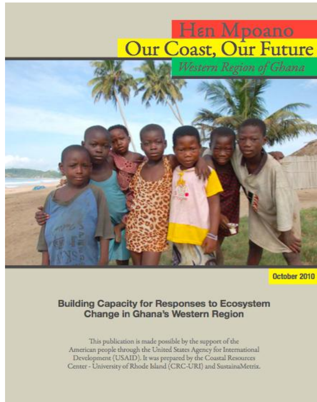
Figure 5: Cover of 'Our Coast'