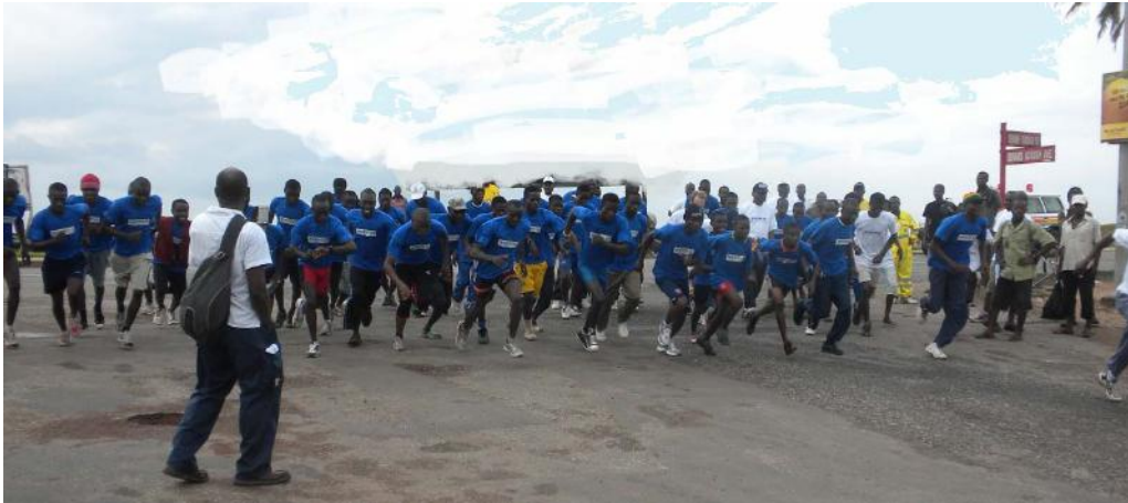
Figure 7: Runners at the starting block at the Wetlands Conservation Fun Run to mark World Environment Day, June 5th 2010

Subsequently, FoN catalyzed four separate debates on the topic of wetlands in which CRC, the EPA, the Sekondi-Takoradi Metropolitan Assembly (STMA), and opinion leaders from the communities discussed wetlands issues on local radio and collected feedback from the public through phone-ins. The engagement with users and regulators generated interest for conservation and several agencies have approached the Initiative about collaborating on management plans for the urban wetland areas. Meanwhile, the Advisory Council has pledged to champion and work with the Initiative for the gazettement of the three major urban wetlands in the metropolis (Whin River Estuary, Butuah and Essei Lagoons) into urban reserve areas to restrict development and encroachment into these wetlands.