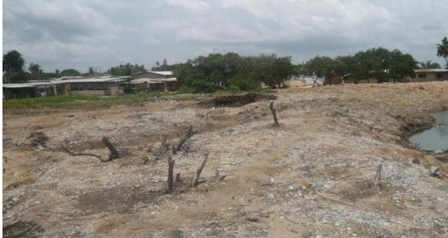
Figure 13: Filling in of and development on wetlands in the Sekondi-Takoradi Metropolis

The Initiative supported a one-day educational session with government officials and district assembly members to highlight the economic, social, and ecological importance of the three main wetland areas in the Sekondi-Takoradi urban area. The workshop was a success, in that several agencies will now work with FoN and CRC on management planning for the wetlands. The department head of economic planning for the metropolitan district government, formerly a promoter for developing the wetlands areas, is now a key ally for the Initiative and sits on the Advisory Council. He has recently and frequently stated in public that “wetlands are not wastelands”. This story shows how useful the press can be in Ghana for addressing confrontational issues and changing attitudes.