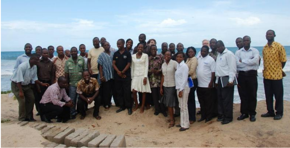
Figure 3: Participants of the second training session at the Aboadze Beach-Shama District

The second training (mid-term) was to review progress and share knowledge and experiences. The occasion was also used to inaugurate the Advisory Council, and to give members the opportunity to learn first-hand about the progress the Initiative was making and about the experiences of participants in the Initiative.