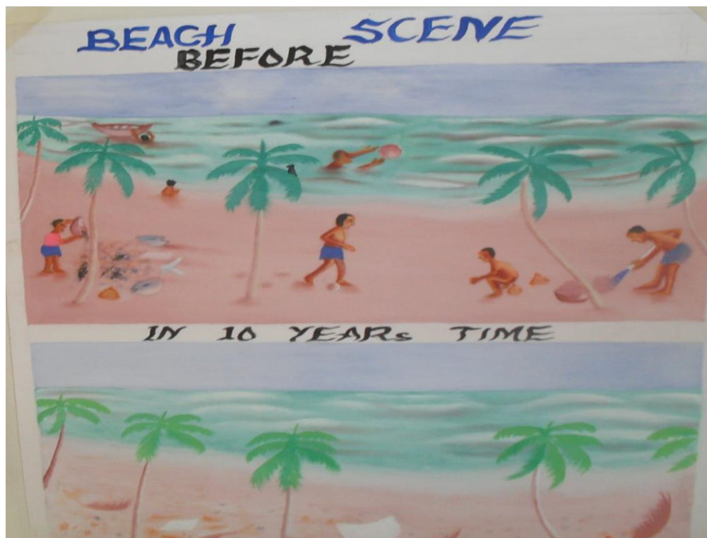
Figure 5 Sketch of a 'preferred future beach'