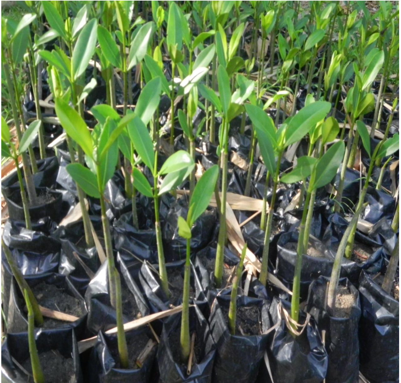
Figure 1 Mangrove nursery