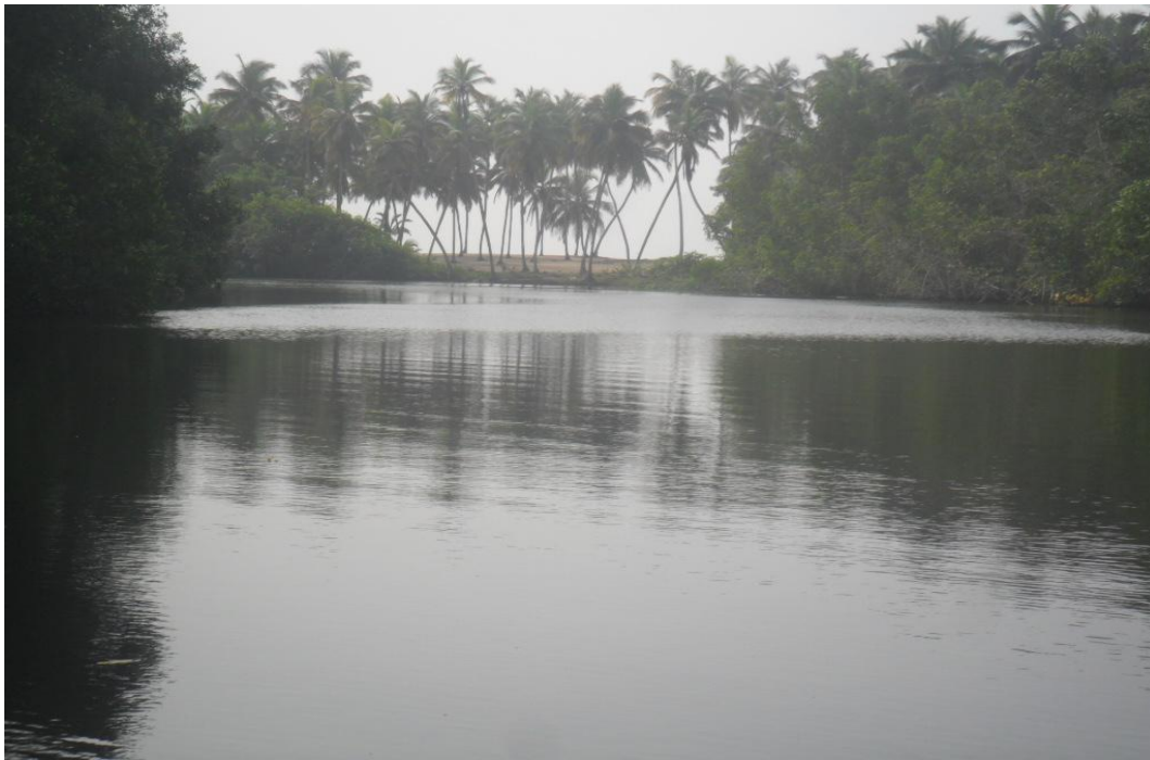
Figure 2 The Amanzule wetland

The retreat which brought together both state and non-state actors involved in natural resource and environmental governance in Ghana was aimed at discussing the future of the Amanzule wetlands areas and proposing conservation scenarios for the wetlands. At the end, stakeholders agreed on the formation of a working group to move forward the issues discussed at the retreat.