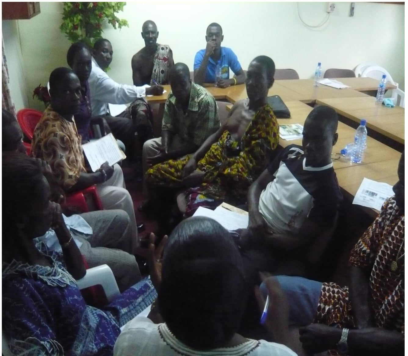
Figure 3 Stakeholder meetings