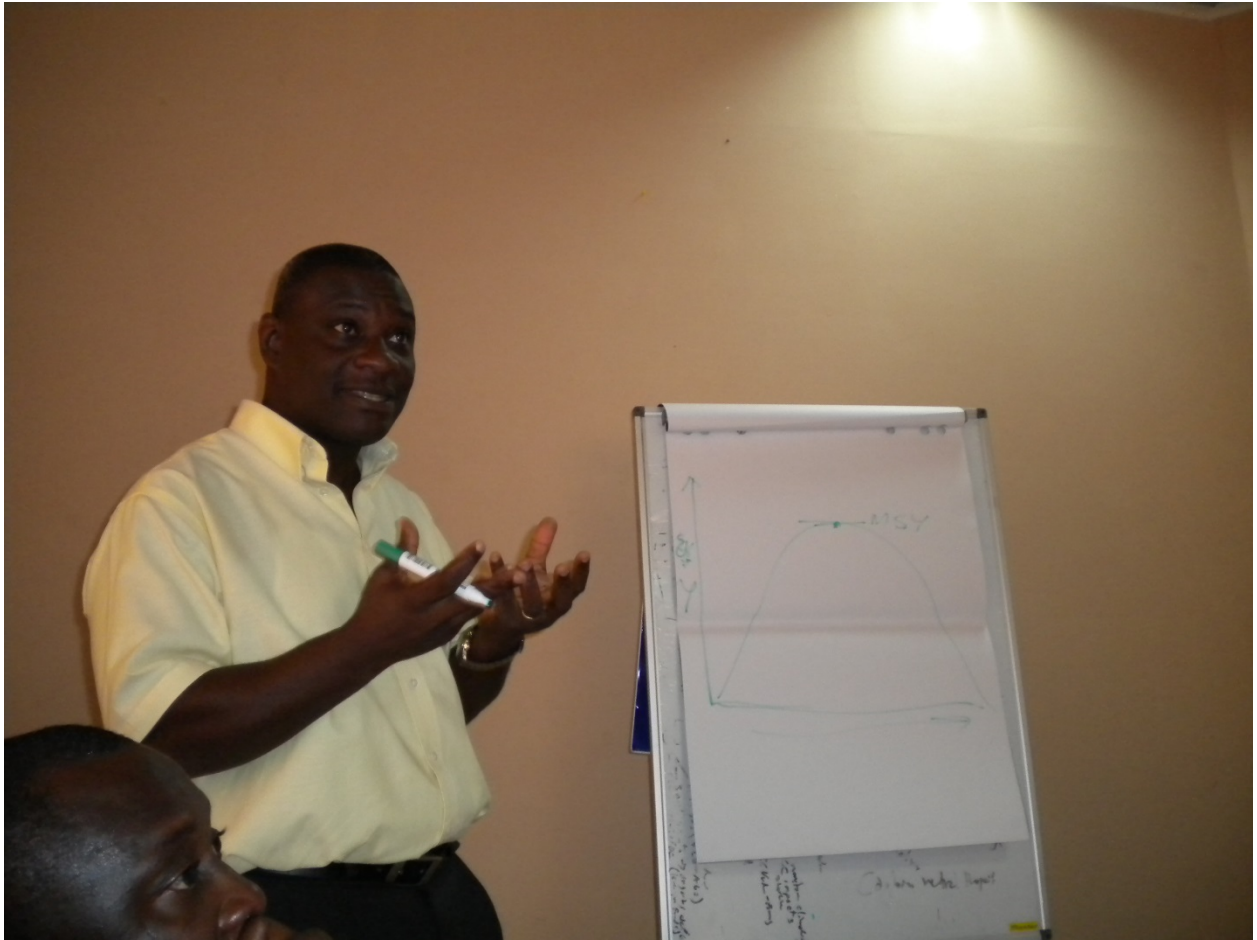
Figure 3 Director of the Hen Mpoano Initiative educating the Fisheries Working Group