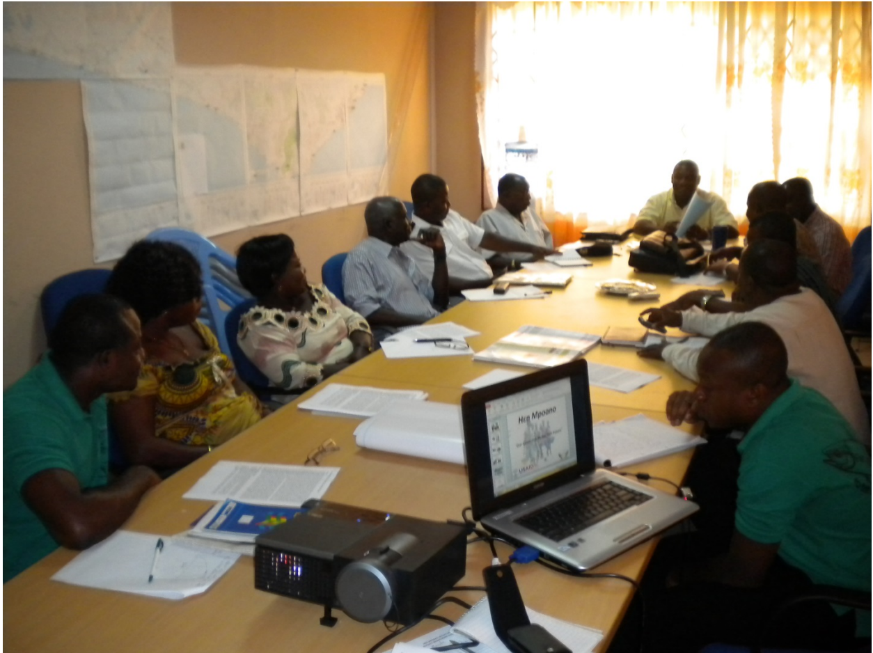
Figure 2 Participants at the maiden meeting

To assist the sub-committee in reviewing their ToR, the members raised some concerns to be considered while executing their mandates. For instance, they mentioned the need to emphasize education of fisher-folks to ensure voluntary compliance of the fisheries regulations (LI 1968). They added that the education must include directions and guides at sea regarding exclusive zones, since fishermen could stray to such areas. Another major concern that was raised was the intrusion of Chinese Nationals into the fisheries industry particularly in boat construction (an activity reserved for Ghanaians).