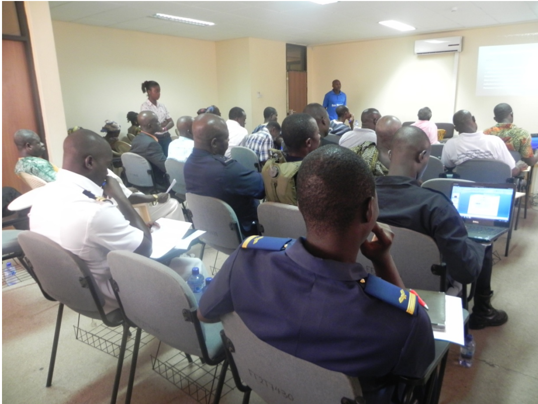
Figure 5 A cross-section of participants during the round-table meeting on voluntary compliance

A round-table meeting on voluntary compliance was then organized by the FWG on May 28, 2013 on the theme “ Addressing Challenges of Compliance and Enforcement of the Fisheries Regulation ”. At the end of the meeting, a communiqué 3 was issued by the 47 stakeholders who attended the meeting. Prior to this round-table meeting, the MuGPS had already visited the coastal communities with some members of the FWG to sensitize them on their mandates. To strengthen regional and district level governance, a courtesy call was paid to the Regional minister’s office to introduce the MuGPS and the FWG