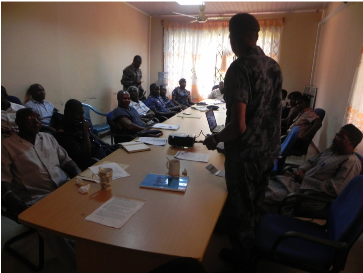
Figure 4 FWG members sharing lessons learnt in one of their meeting

Regarding District and Community level engagements, it was noted that efforts had been made to get fisheries issues discussed at the district assembly level in the course of 2011. It was realized from these engagements with the District Assemblies that officials of the Assemblies were largely ignorant of happenings in the fisheries sector. Some issues that came up from the engagement were that Canoe registration to be undertaken by the coastal District Assemblies. There was also the need to empower chief fishermen in the communities to make their role significant in these changing times. The FWG members expressed much appreciation to the ICFG Initiative and its funder USAID for the support; and encouraged the Initiative to continue its dialogues with the District Assemblies, as they still do not have a full grasp of the issues in the fisheries sector.