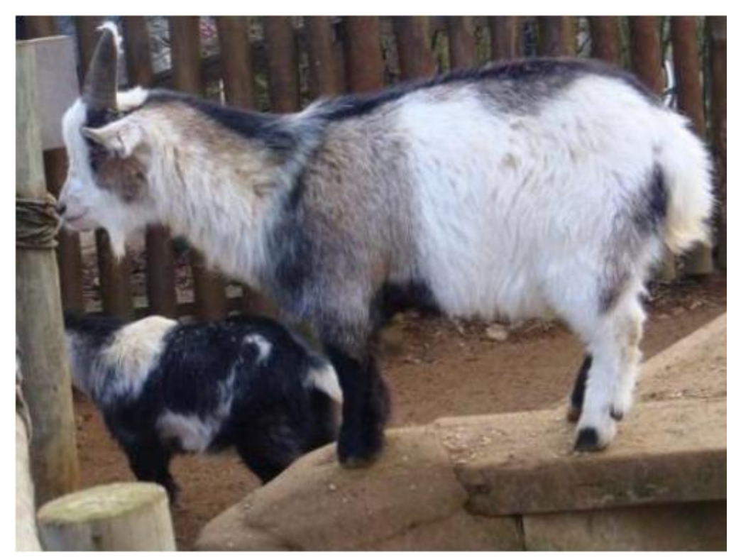
Figure 11: A Goat

In most communities surrounded by the Amanzule wetland or other lagoons in the Nzema area such as Kikam, Elloyin and Beyin, goats are not allowed and also not permitted close to wetlands. Interestingly, most residents in such communities acknowledged eating goat when they out. One may ask why? The answer is linked to a ritual performed using goat in the olden days to save the people of Nzema during a war between the Nzema's and the Ayin people. But basically, the reason is quite similar in most communities. As narrated by Mr. Lawrence Kwesi, a community elder in Ellonyi: