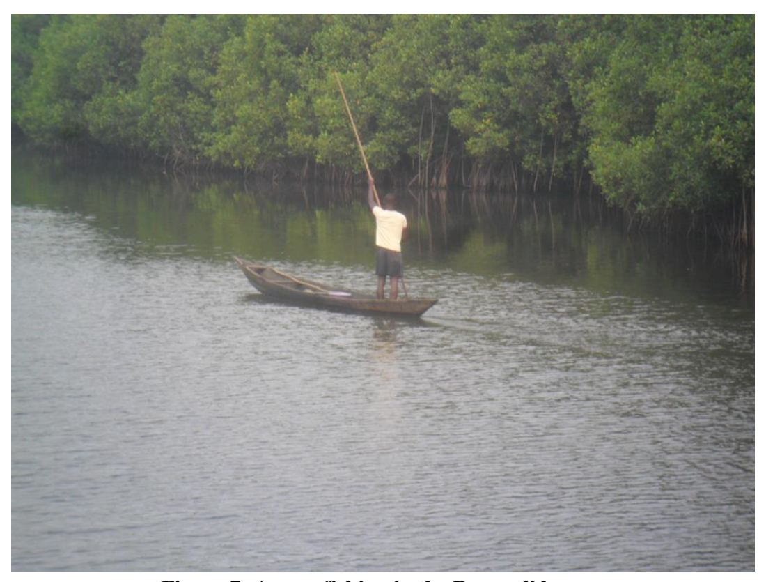
Figure 7: A man fishing in the Domunli lagoon

Without doubt, all key informants and FGD participants could not hide their appreciation to the values provided by wetlands in the olden days and even in recent times. Almost all traditional believers did not miss words in lauding the spiritual protection offered by the wetland gods to the people of Nzema. Next was the economic importance of the wetlands to coastal inhabitants. Wetlands, they believed have over the years provided employment and as such a major source of income to the people along the coast since most of them have remained fishers by tradition. Recently, in some areas, tourists have shown great interest in knowing about the wetlands and therefore becoming another source of employment but to a few. This is prominent in Nzulezu (the famous stilt village) and Ebonloa where Ghana Wildlife Society is contributing to the promotion of tourism.