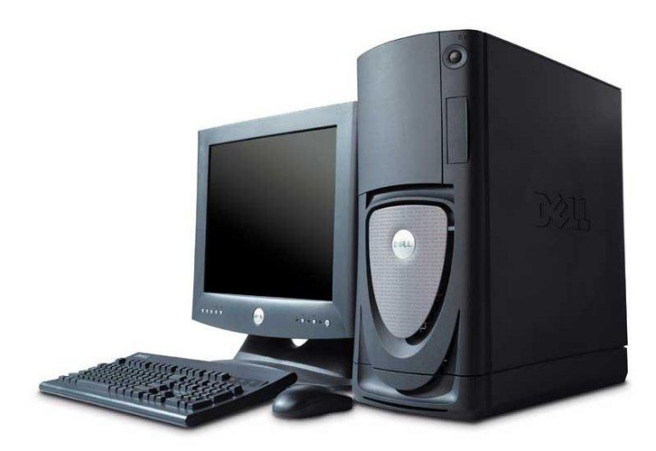
Figure 14: Computer

the Bilea wetland died about 40 years ago, there has been no replacement as people deemed fit for the position have turned to Christianity and showed great disinterest for the post''.