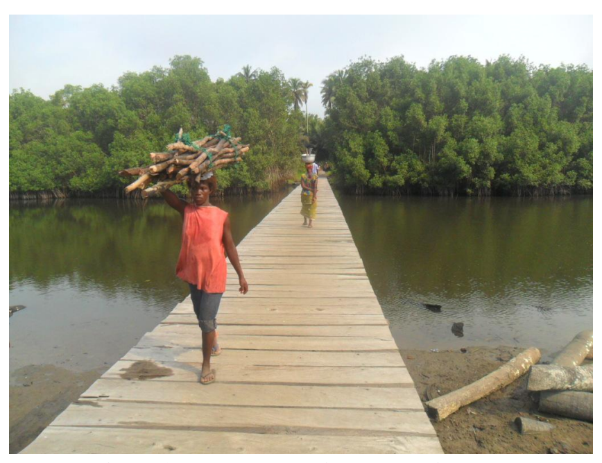
Figure 10: Women crossing Domunli lagoon

The situation regarding women during their period of menstruation takes a different dimension in Nzulezu (the village on stilt). In Nzulezo, there were special rooms outside the community where women who were menstruating were mandated by customs to reside until the period is over. Their husbands in such times were made to equally stay with them throughout the period. Currently however, such women only go the special room to take their bath but do not stay there. It was sad to note that there were instances in the past where some women who went to take their bath in that special room got drowned and died.