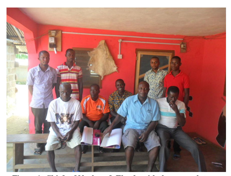
Figure 1: Chiefs of Nzulezo & Elenda with the research team

The research team deeply appreciates the support, time and inputs by traditional rulers, traditionalists, family heads, opinion leaders and all others that made the community information gathering a success. Special appreciations go to the Chiefs of Nzulezu, Bobrama and Elenda as well the royal family heads of Beyin, Azulenoanu, New Nzulezu and Ellonyi for their great inputs.