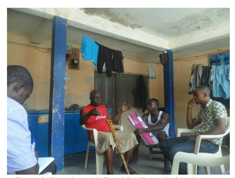
Figure 2: Interview with Royal family head of Azulenoanu

The study, conducted between January 28 and February 3, 2013, covered 12 and 10 communities in the Jomoro and Ellembelle districts respectively. These 22 communities were selected based