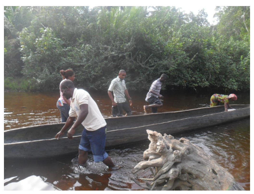
Figure 4: The Research team on their way to Old Bakanta

Most wetlands in the study area got their names from mysterious ways but are all related tightly to tradition. As indicated by Opanyin Abakah Kumi of Ekpu, ''the epokazule lagoon in Ekpu attributes its name to the catch of many epoke (tilapia) in the lagoon''. Some wetlands equally have their names linked to that of the community. This holds true for communities such as Effasu, Ellonyi and Ekpu. Such communities were named after the wetlands that surround them. For instance in Effasu, a Community elder, Mr. Isaac Nda Mieza noted '' our lagoon is called Effasu Anloenu and so this community was named by our ancestors as Effasu—just after the lagoon''. Indeed, in all the 22 communities appraised, no wetland has had it name changed over the years. This is because the names were handed over to generations by tradition. As the study targeted communities that had wetlands.