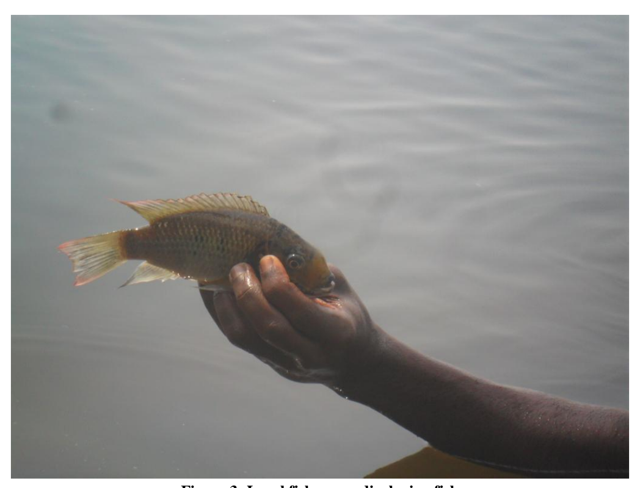
Figure 3: Local fishermen displaying fish

on their proximity to a wetland. They were, in the Jomoro District: New Town (Avolenu), Effasu, Metika, Half Assini, Ekpu, Egbazo, Old Kablensuazo, Ezinlibo, Ellonyi, Ebonloa, Nzulezu<sup>4</sup> (Old and New) and Beyin. The rest in the Ellembelle District were: Old Bakanta, New Bakanta, Azulenonu, Ampain, Sawoma (Ankobra), Bobrama, Kikam, Alabokazu, Asemdasuazu and Alloekpoke.