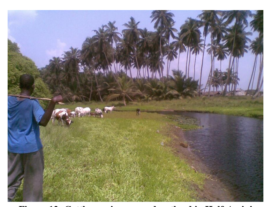
Figure 12: Cattle grazing around wetland in Half-Assini

In other communities like Old and New Bakanta (meaning twin lagoon), local pigs are not allowed in the community let alone closer to the wetland. Piggery was abolished because pigs were found of exhuming young people at the cemetery and making wetlands areas very dirty. However, in recent times, rearing of foreign breed of pigs is allowed in the community. The olden generations found ways to keep our wetlands in clean state. Unfortunately during the study, cows and pigs were found around the Amanzule wetland in Half-Assini as depicted in Figure 12.