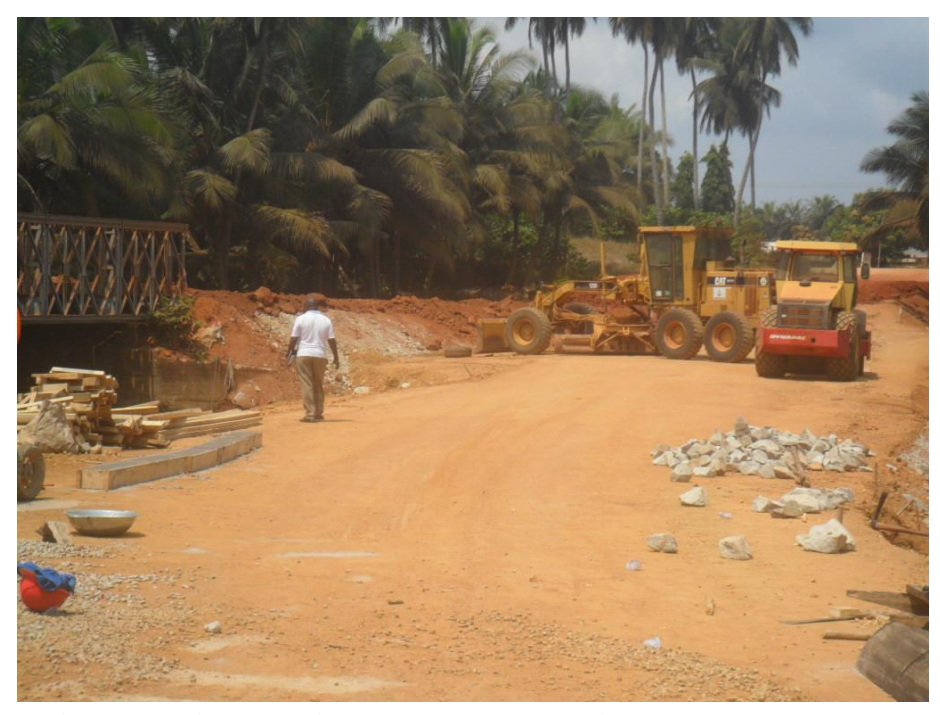
Figure 13: A new bridge under construction over Ellonu lagoon

Indeed, such rituals, as pointed out by community elders were very important and strictly adhered to. At Azulenoanu, it was indicated by a family head that ''the community at some point in time stopped performing the necessary rituals and this resulted in the gods killing most community members. However, upon advice from the Chief priest, we started performing the rites and the killings stopped and in return the community received blessing and protection from the gods''.