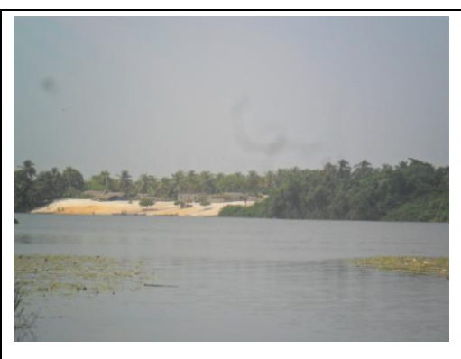
Table 4: Footballers & Balibangara lagoon

Footballers in New Town had a belief that worked for many years that the Balibangara lagoon (showed left) was capable of helping them to win football games on two conditions. That the match is