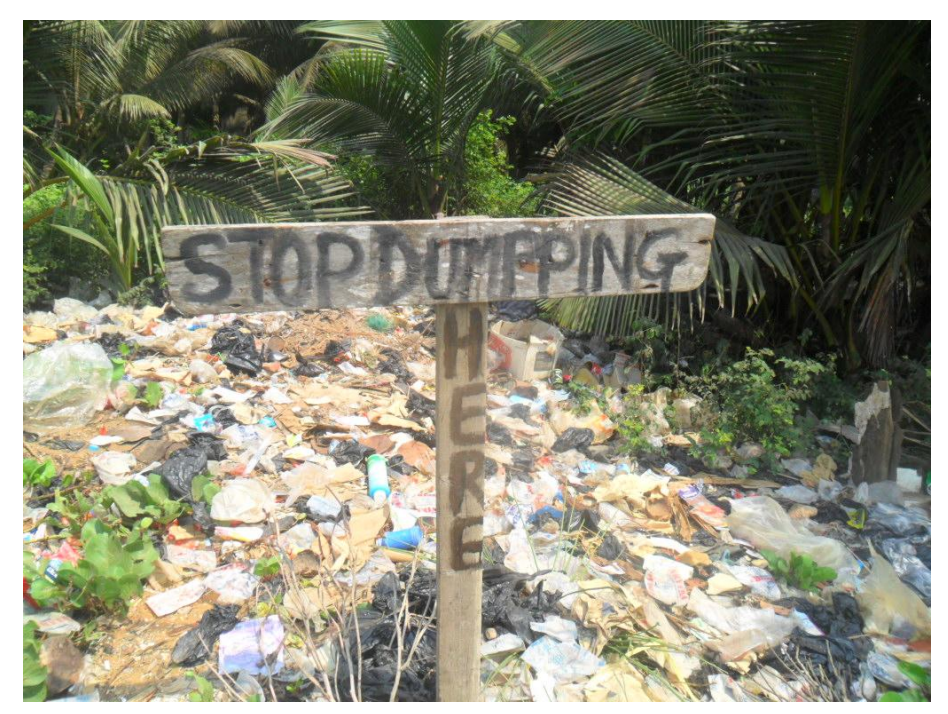
Figure 9: Refuse dumped at Upper portion of Edinla lagoon in Ezinlibo

The mangroves found around most wetlands also have traditional importance. Fishermen used and continue to use the mangroves to dye their fishing nets. Local housing also made use of mangroves but were cut on a sustainable manner.