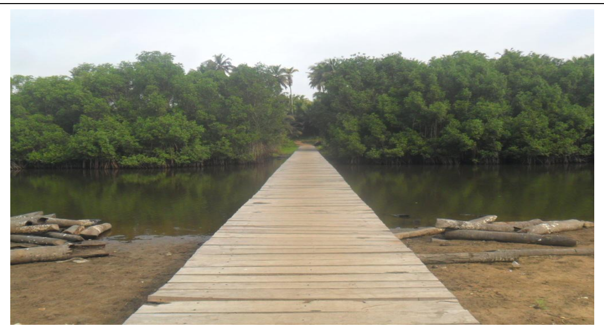
Table 5: Showing reverence to wetland gods