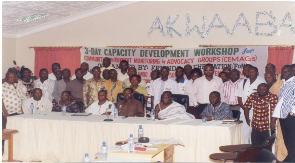
Picture of CEMAG members in a 3-day Capacity Development Workshop