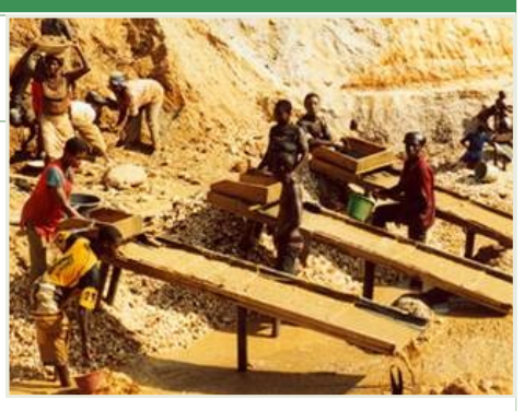
Encroachment on companies' concessions lead to conflict

The whole point of attracting investors is to make sure they make a big impact with the economy and lives of the people. With the establishment of the Coastal Foundation, it appears that there is a realization among companies that their future is tied to that of local communities. But companies that do not play by the rules of social responsibility are being