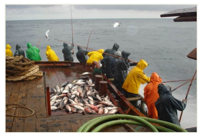
Industrial fishermen at work

The mandate of the group is to advice the fisheries Directorate in the region on pertinent issues affecting the sector in the region and also to be a link between the associations and institutions, and the Fisheries Directorate in terms of information dissemination.