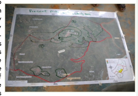
Product of participatory planning

erosion and other coastal hazards. These and hence ensured better adaptation to impacts and changes will likely acceler- the impacts of climate change. The par-