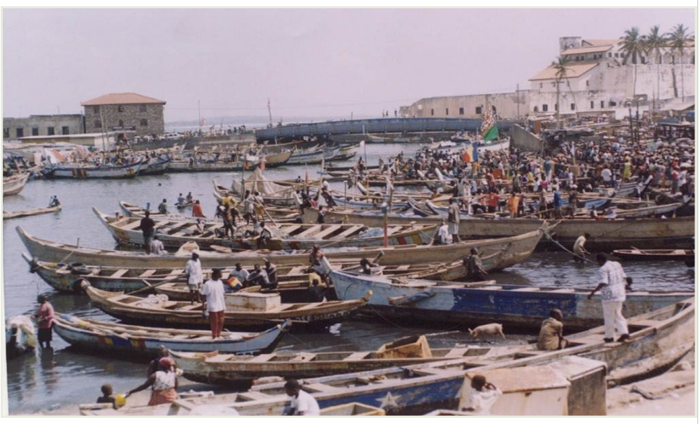
A typical scene in a fishing harbour

Ghana's coastal and marine ecosystems are sustainably managed to continue to generate a long-term socio-economic